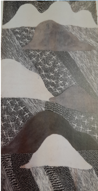
Tears of the Djulpan