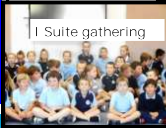
I Suite gathering